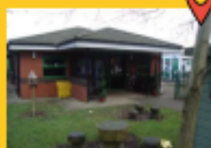
Brandlesholme Road, BL8 1AX.