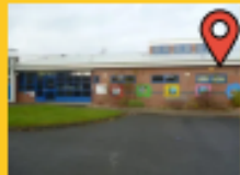
Next to Radcliffe Primary School, M26 3RD