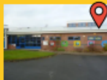
Ribble Drive, M45 8TD.